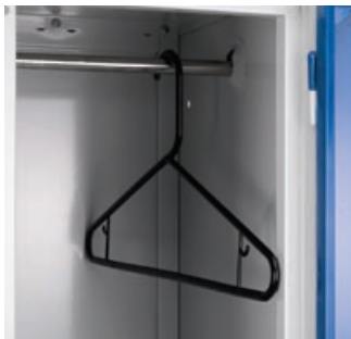
Single and 2 door 450mm deep options supplied with removable hanging rail for use with coat hangers

Available in blue or grey door colour options