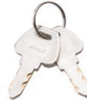
2000 differ keys, cut on both sides to increase strength