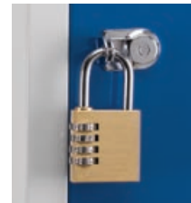
Swivel Catch lock option for use with padlock (padlock not supplied)