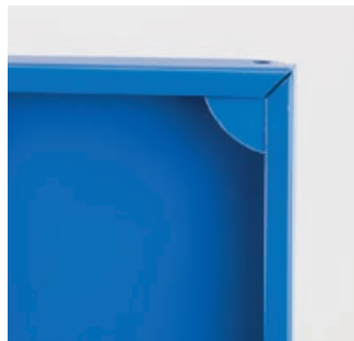
Full height and corner stiffeners on door provide extra strength and rigidity